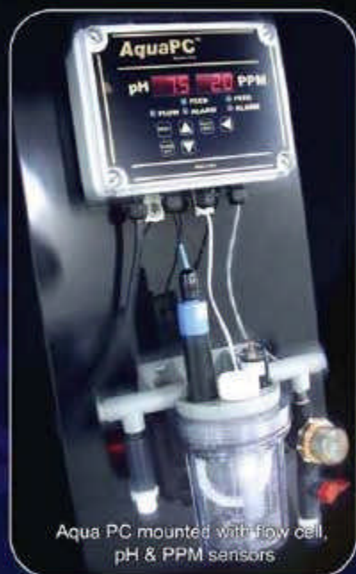
Aqua PC mounted with flow cell, pH & PPM sensors

Eliminate the time and hassle of handling pool chemicals with an automated chemical controller. The Aqua PC is safe, clean and effective with total accuracy. Swim safely with the confidence that Acu-Trol intelligence is monitoring and controlling your pool and spa. The Aqua PC is working for you maintaining proper and perfect pH and chlorine balance.